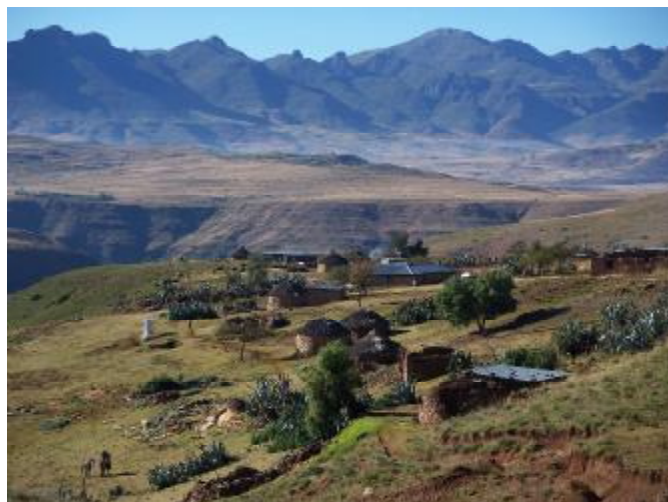
Traditional village near Malealea, district of Mafeteng