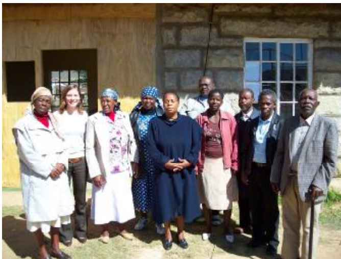
Members of Qacha's Nek Community Council after group discussion