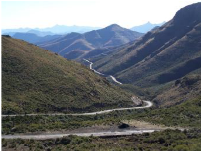
En route to Semonkong ("Place of Smoke"), district of Maseru