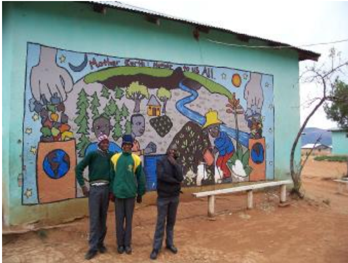
Improved service delivery? Secondary school in Quthing district