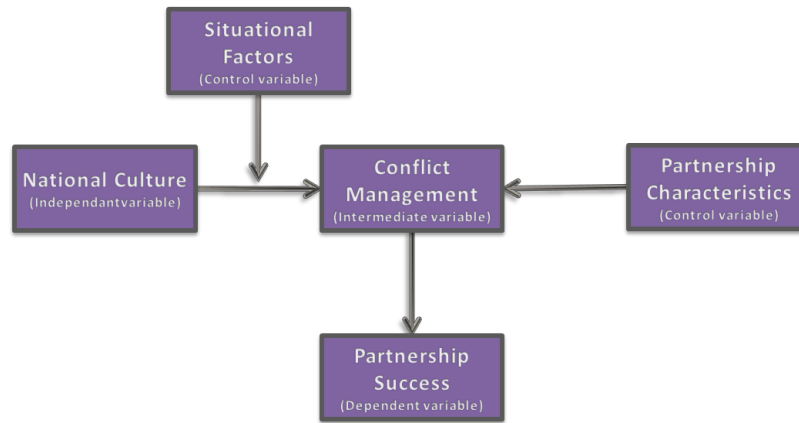
Figure 2 Overview synthesis study relationships