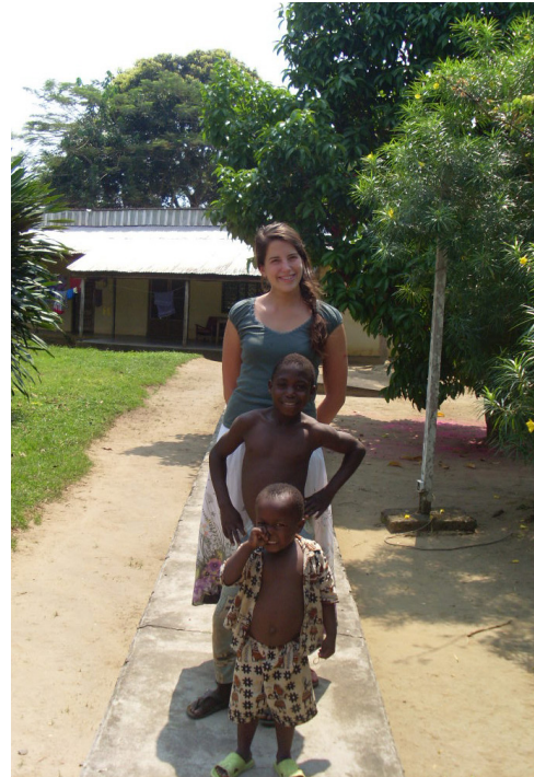
Front of the hospital Banga Bakundu

In the period of November 2011 to April 2012, I went to Cameroon to do my bachelor research about HIV and AIDS for the Dutch organization Give Milk Stop Aids. Two Dutch medical students founded this organization in 2004. They examined HIV positive pregnant women during their internship in the Apostolic Hospital Banga Bakundu, a rural area in Cameroon. HIV is present in the breast milk and for that reason it was better for the pregnant women to give bottle-feeding, according to the medical students. These pregnant women were generally poor and couldn't afford the milk. That is why the two interns founded Give Milk Stop Aids.