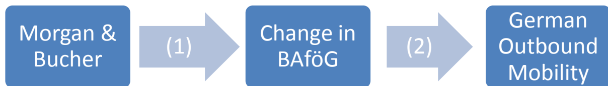
Figure 8: Hypothesized Causal Chain

For both relationships, Babbie's condition for causal relation will be applied, which comprise correlation, time order and non-spuriousness. Contrary to the visualization, this thesis will focus on the second relation first to prevent a back and forth between purely national and national-to-European involvements.