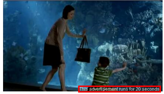
Figure 2: Still of a random video-ad on video platform Dumpert

information directly in the video screen.