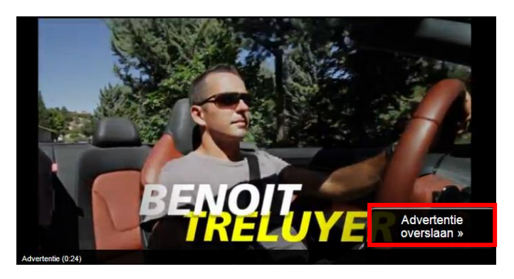
Figure 1: Still of a random video-ad on video platform YouTube

With video-ads, it varies whether a viewer has the possibility to 'skip' the ad. Although it creates more freedom for the viewer and might elicit more positive responses, with the skipping of the ad the advertising company loses the opportunity to communicate their message. In figure 1 an example of a pre-roll video-ad is given