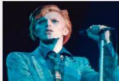
David Bowie bei einem Auftritt im Jahr 1976

folgten. Kommerziell und weltweit erfolgreich wurde er in den 1980er Jahren mit den Alben „Scary Monsters“ und „Let’s Dance“. Auch im folgenden Jahrzehnt zeigte er sich gewohnt kreativ und ehrgeizig. Seine Alben aus den 1990er