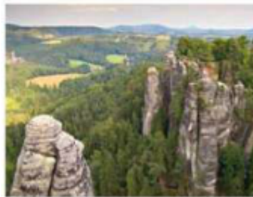
Bizarre Felsformationen im Elbsandsteingebirge

Elbsandsteingebirge – Märchenwelt und Meisterwerke. Von Kasperköpfen, Sandsteinarchitektur und Lachsbrütlingen. Highlights aus Dresden und Umgebung.