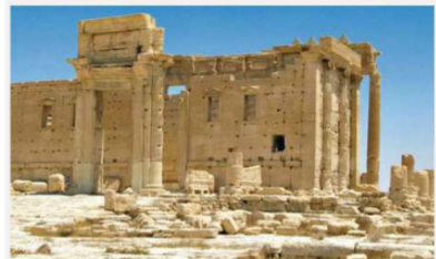
Dieser Tempel im syrischen Palmyra war der antiken mesopotamischen Gottheit Baal geweiht

(3) Die arabische Eroberung. (4) Das Goldene Zeitalter des Islam. Die Entstehung und Verbreitung des Islam und: der Einfluss arabischer Wissenschaftler auf europäische Gelehrte wie Galileo Galilei.