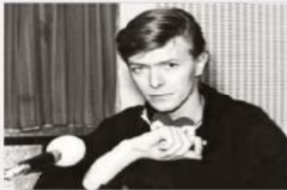
20. Mai 1979: David Bowie ist Gast-DJ bei Radio 1

Exzentrischer Ausnahmemusiker mit außergewöhnlichem Werdegang: David Bowie, das Pop-Chamäleon, erfindet sich stetig neu – von „Ziggy Stardust“ bis „The Next Day“. Ein Porträt.