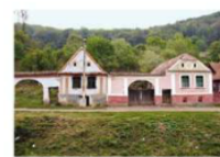
Aus Alt mach Neu: Dörfer in Siebenbürgen

Siebenbürgen und der Prinz. Viele Dörfer Rumäniens, in denen früher viele Angehörige der deutschen Minderheit lebten, sind vom Verfall bedroht. Diese Entwicklung versucht eine englisch-rumänische Stiftung unter der Schirmherrschaft von Prinz Charles aufzuhalten.