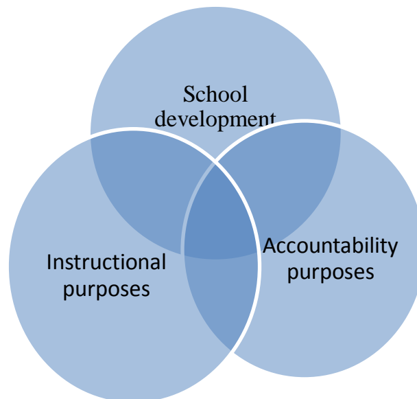
Figure 2: The overlapping nature of the purpose of data for school improvement

Data use in schools can lead to school improvement. This is the process of making schools better through programme for innovation focusing on change and problem-solving in educational practice. Part B of the Theoretical framework used in this study, data in schools are used for school development, instruction purpose and for accountability purpose (Breiter & Light, 2006; Coburn & Talbert, 2006; Schildkamp & Kuiper, 2010; Schildkamp, Lai & Earl, 2012; Wayman & Stringfield, 2006; Wohlstetter, Datnow & Park, 2008; Young, 2006). This means that schools have to design and invent their own solutions for specific problems and improvement in general. The use of data for genuine improvement actions (e.g. for school development, for Instruction purposes, and for accountability purposes) may lead to school improvement in terms of increased student achievement (Schildkamp & Kuiper, 2010). However, these aspects do not work isolately. There is an interaction of activities with more than one purpose, or one group of activities for one purpose may have direct or indirect effects to other activities for different purposes.