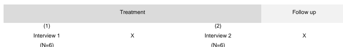
Figure 2 Research design care professionals

Care professionals were interviewed twice over a timespan of several weeks (Figure 2). These interviews were scheduled in the same weeks as the interviews with patients with lung diseases and the first oncology group included in this study. This was done to give care professionals the opportunity to come up with real examples from current treatment groups. It was decided not to do a third interview with the care professionals, due to the fact that the treatment stops for the care professionals after twelve weeks, which means they have no role during the follow-up period. The goal of the first interview was to gain knowledge about the intentions and expectations of care professionals on adherence to the treatment and their intentions to use (or not use) the portal within the treatment. The main objective during the second interview was retrospective, looking back on the treatment of a particular treatment group, providing an insight in the actual usage of the portal and patient adherence.