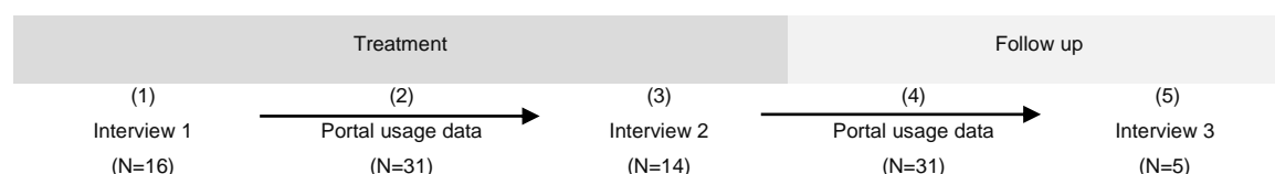
Figure 1 Research design patients

usage data being tracked for scientific purposes. Only users who agreed on this were included in the study. Thus, the usage data from people who did not sign up for the interview sessions, but who were using the portal and gave permission for usage tracking, were also tracked.