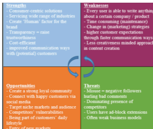
Figure 2. SWOT analysis of social media