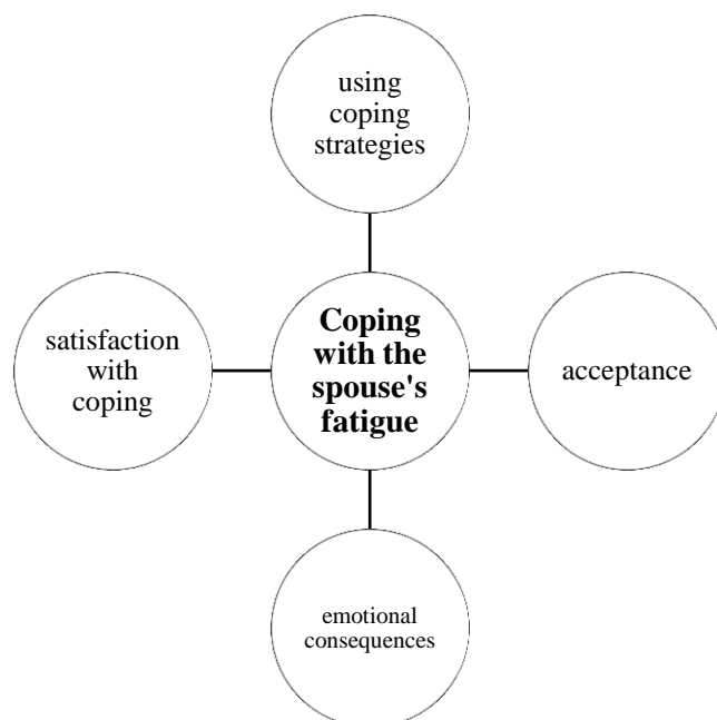
Figure 2a. The different aspects of the partner's perspective on coping with the spouse's fatigue

visually represents the different aspects of the partners' perspective on coping with their spouse's fatigue.