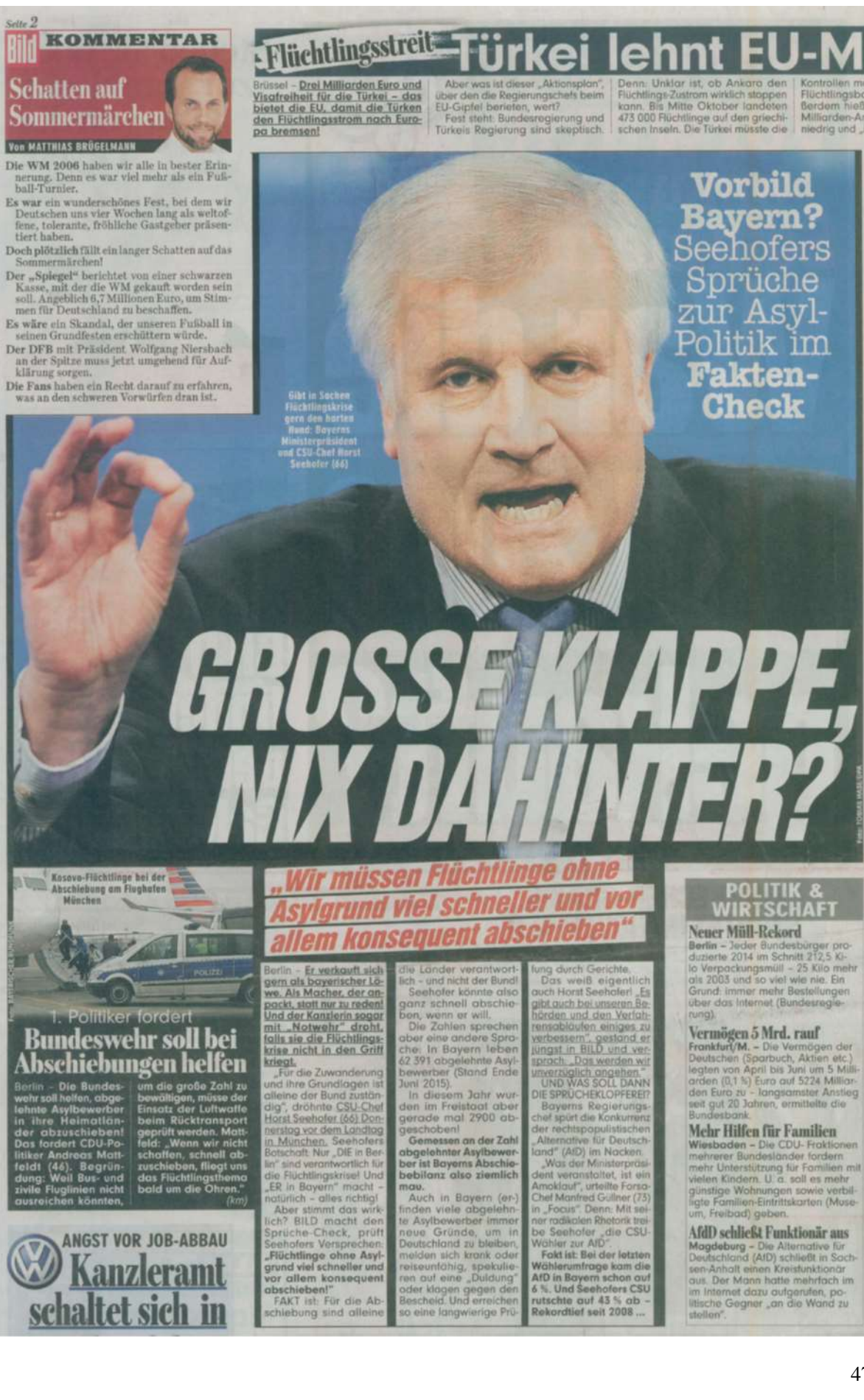
Figure 5: Newspaper article: Case 5: Bild