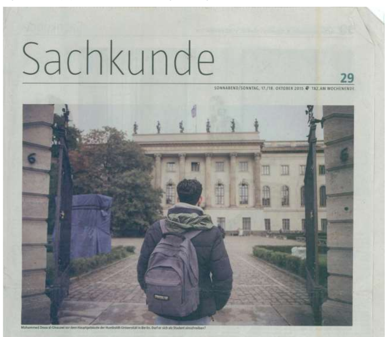
Figure 2: Newspaper article: Case 2: Die tageszeitung

universität Bildung ist der Schlüssel zur Integration, heißt es. Aber was passiert, wenn ein Flüchtling aus Syrien in Deutschland sein Wirtschaftsstudium fortsetzen will?