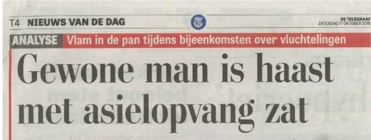
Figure 4: Newspaper article: Case 4: De Telegraaf