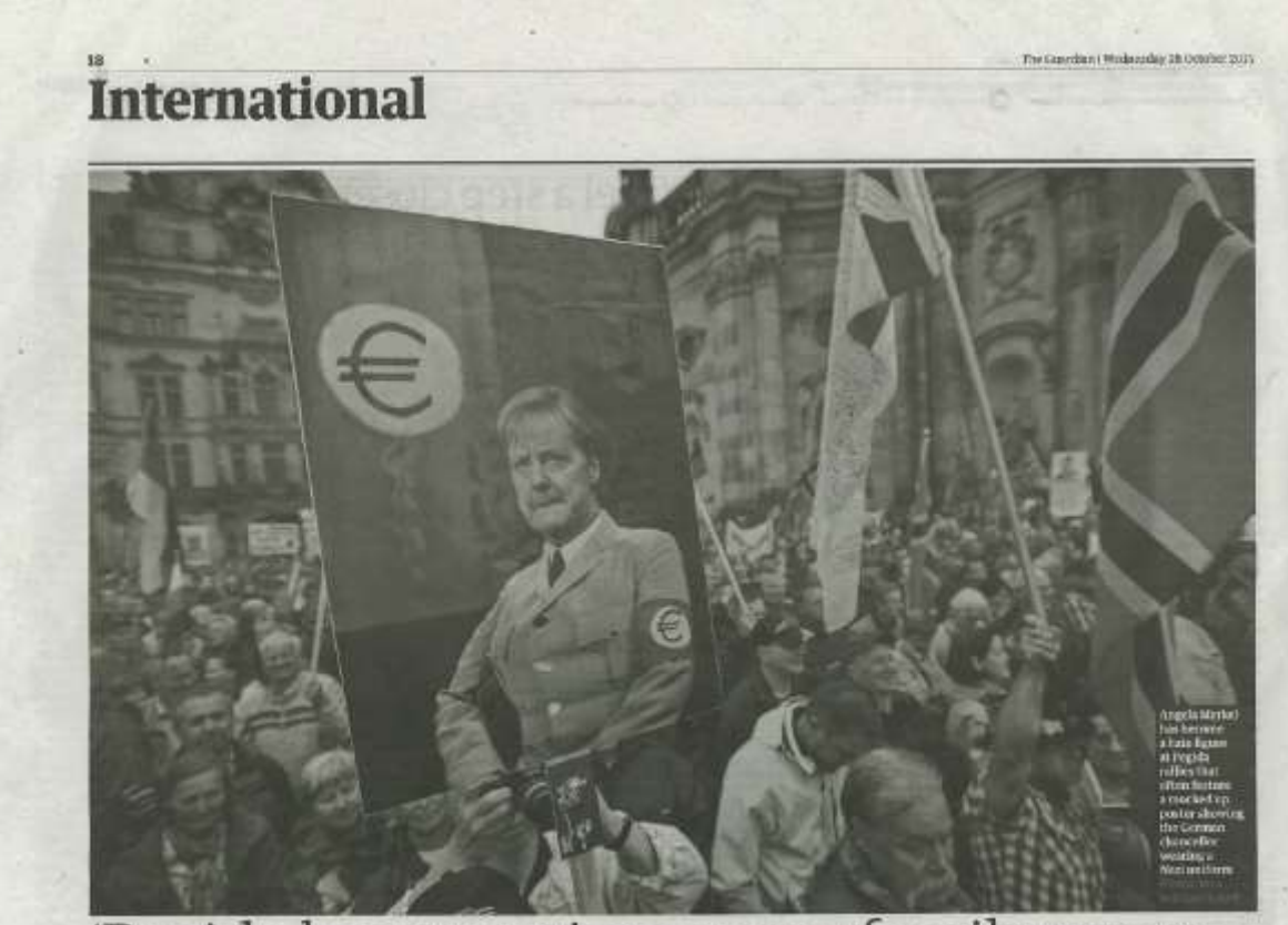
Figure 3: Newspaper article: Case 3: The guardian