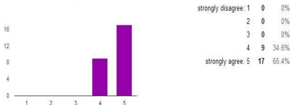
Table 5: Results to survey question no. 17

(1) strongly disagree; (2) moderately disagree; (3) neither disagree nor agree; (4) moderately agree; (5) strongly agree