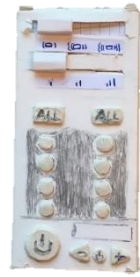
Figure 1: Paper mockup

The concepts have been combined to one total concept. This has been worked out more in detail in the embodiment design phase. Crucial information for the construction of the orthosis has been figured out in a brainstorm session with the different experts of Perteon Seats. Besides, necessary technical components for the chosen concept have been identified in collaboration with electricians and technicians. Moreover, a paper mock-up of the remote-control has been made to execute a little user test. It has been indicated that the designed interface is too complex for some users. Therefore, recommendations have been worked out for a redesign in the future.