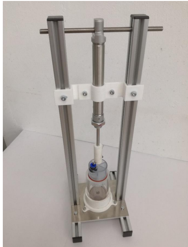
Figure 3: The compression set-up.

From tests with these three concepts, two turned out to be the most promising. With these last concepts, elaborate tests were done. The height difference in the coffee bed, when using or not using these concepts, was measured. To make a considered decision, other factors like integratability were also taken into account. Eventually a final concept was chosen, a conclusion was written and recommendations were made. The developed system reaches all the ground in the coffee bed and creates an even surface. The coffee can be distributed using this system, and after compression a perfect coffee puck can be created. The system creates better tasting and consistent espressos. To integrate the concept in a vertical brew chamber, more research and tests should be done. The emphasis should be on the stiffness and cleaning of the concept. Eventually the concept can be placed in the demonstrator and the newly gained knowledge can be shown to customers.