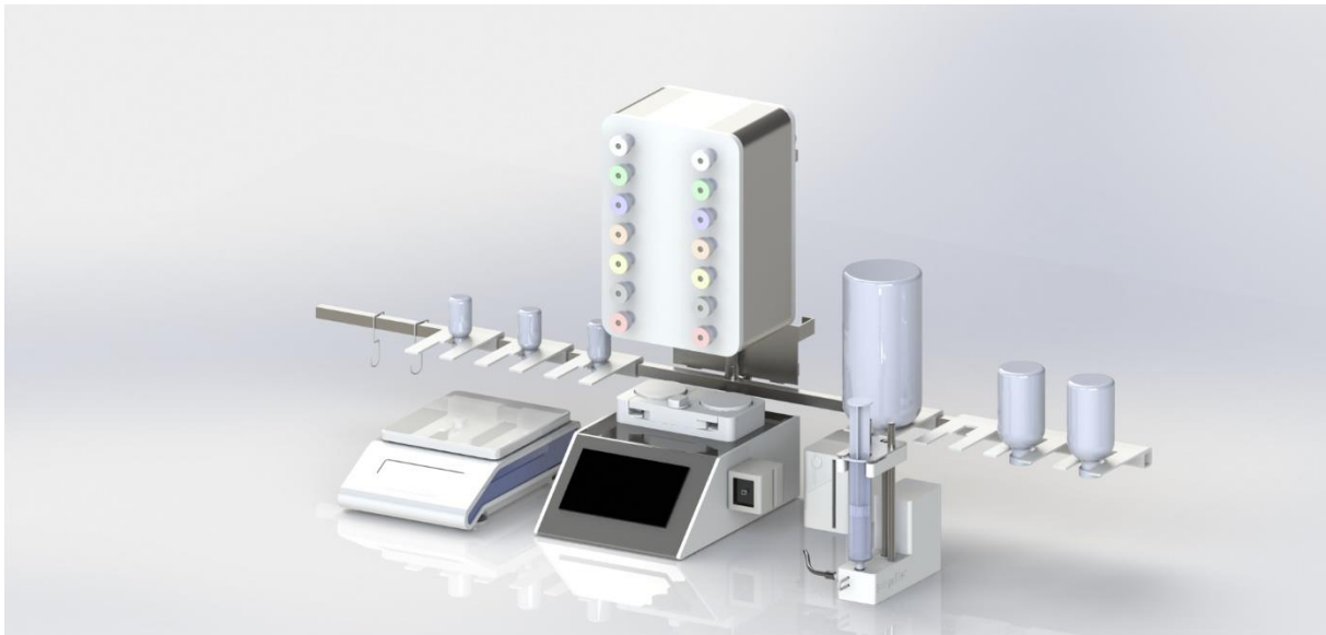
Figure 2: The final EasyCompounder system

During the integration process, the filler was created. The Filler can be used to fill syringes, vials, and can withdraw fluid from a vial with a syringe. To do so only the setups have to be changed. The Filler should also be lifted from the work surface. An idea for this has been created but is not worked out yet, because of time limitations.