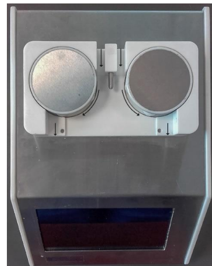
Figure 3: Indications in the pump

There are still some points of improvement because within the time frame not everything could be optimized, and some things did not fall within the scope of the project. It was discovered that there is a possibility that ingredient fluid stays behind in the tubes after flushing the tubes with flushing fluid. It should be tested what the flushing speed and volume need to be in order to be 100% sure that there is nothing else in the tubes than the flushing fluid. Besides this, it should be tested if the bottle holder needs an addition of a click system or a ridge with provides friction, to make sure the bottles stay better in place. Finally, it is advisable to test the new modules as soon as their first versions are done. This way it will be easier to adapt them and the best solution for the pharmacists can be created.