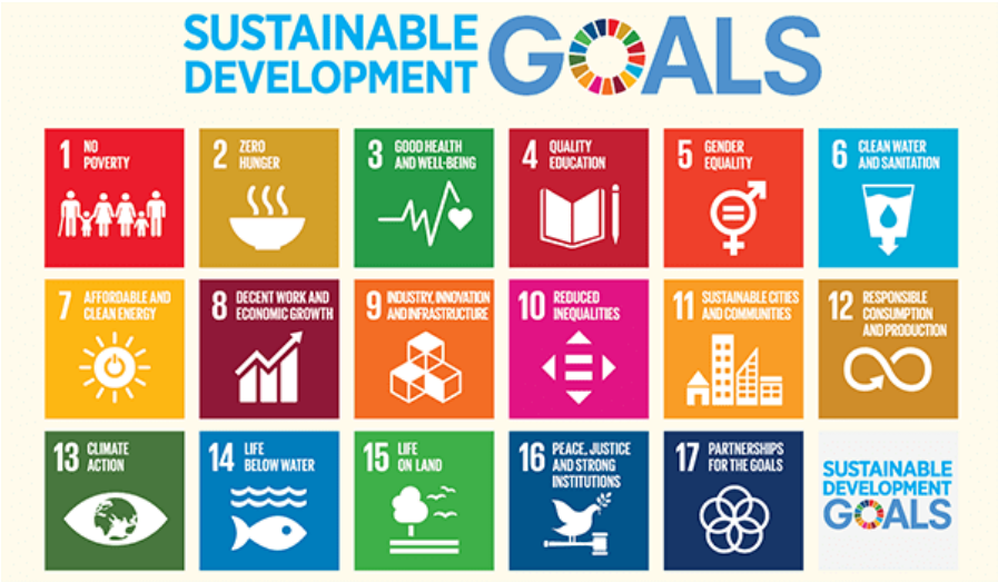
Figure 1. Sustainable Development Goals overview