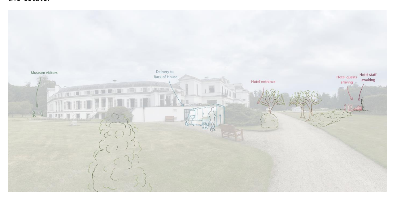
Figure 4: The different flows from one point on the estate

Finally, in Figure 4 the different mobility flows on the estate can be seen from one point on the estate.