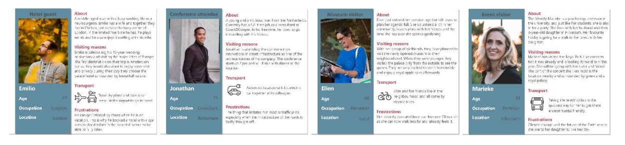
Figure 1: Personas of some stakeholders

The stakeholders who make use of the mobility plan in the future were the starting point of the research. First, the stakeholders had to be defined. This was done by looking at all the future functions of the estate and the movements over the estate they will require. The stakeholders were grouped into 4 main categories, the visitors, the staff, delivery and collection, and the natural environment. A list of requirements of the stakeholders was created by researching company documents and interviewing stakeholder representatives and company experts. Here quantitative and qualitative requirements that could influence the mobility plan were described. A tool used to better describe some stakeholders was creating personas (Figure 1). With the personas, the focus of the design shifted to the users, as they will be the ones using and (sub)consciously following the mobility guidelines of the service-oriented activities on the estate.