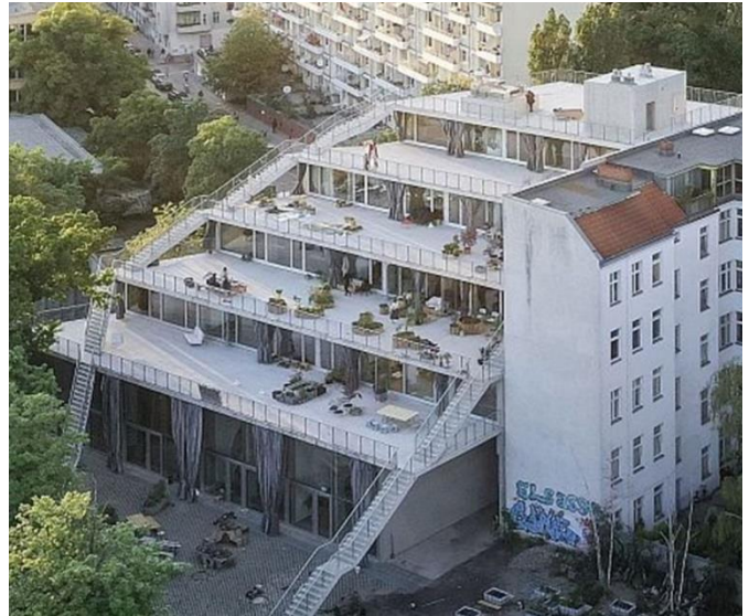
Figure 1 The Terrassenhaus

To improve this, a more thought through outdoor furniture selection is needed. This bachelor thesis is carried out in cooperation with Loehr, a Berlin based furniture design company that also specializes in creative services. They initially have designed the interior of a part of the Terrassenhaus and have been aware of the outdoor furniture situation ever since.