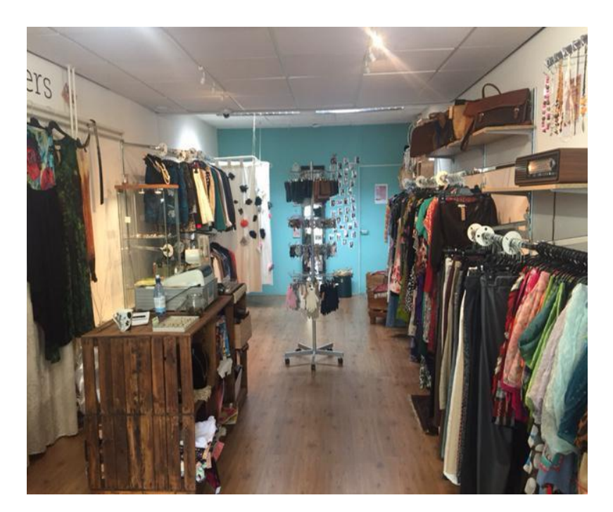
Appendix B: Shop where the experiment took place, condition with a mirror