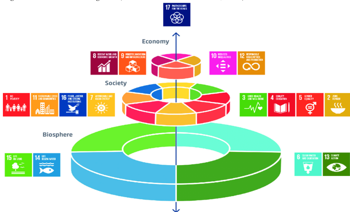
Figure 2: The SDG-wedding cake (Stockholm Resilience Centre, 2016)

The Sustainable Development Goals consist of seventeen goals, and 169 subgoals that operationalize the seventeen goals. Table 2. shows the seventeen goals and what they aim for 8 . Within the seventeen goals, there are three scopes. Within these scopes, a so-called wedding cake can be made, hence the SDG-Wedding cake. This framework suggests that there is an interaction between all the SDGs, even though they are in a different layer. According to the Stockholm Resilience Centre (2016), food is the main character of the SDG-framework, in which all goals are directly and indirectly related to food. However, the explanation of this model focusses on food. On the other hand, the model does show a relationship between People, Planet, and Profit.